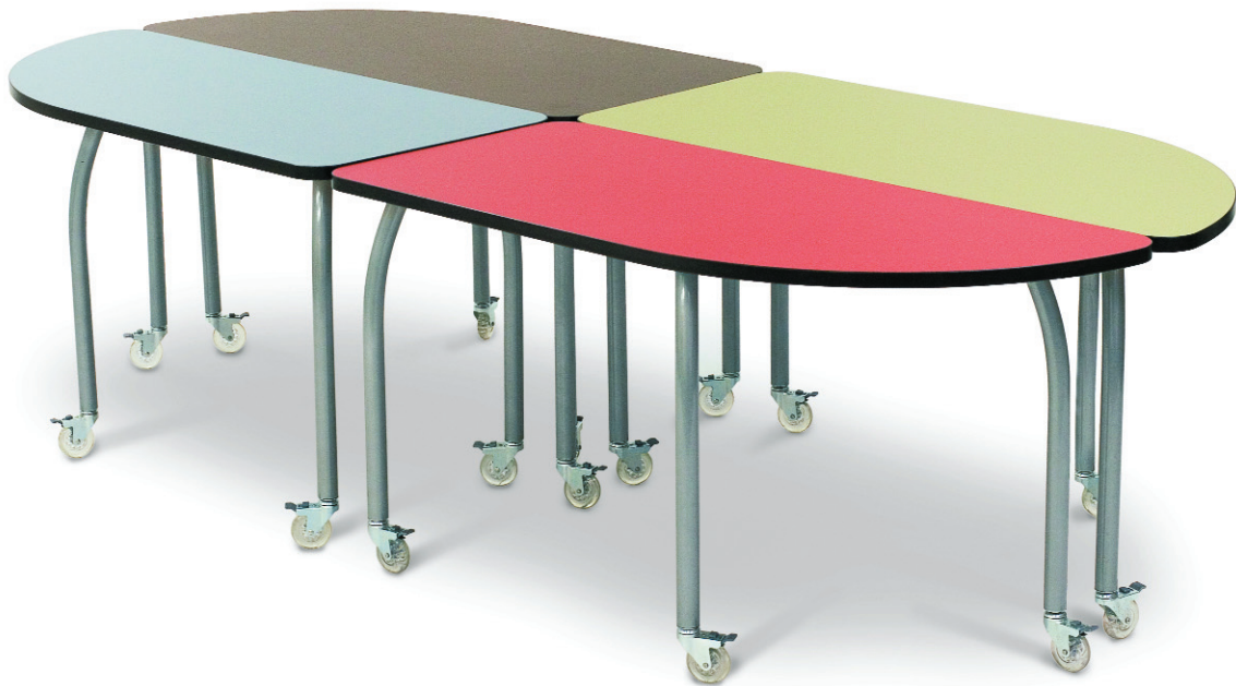
SHUTTLEZONE CONFERENCE - END TABLES on Arc Legs with locking casters

Reshape conference rooms and commons instantly