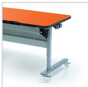
Top-loading wire tray attaches to modesty panel