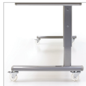
Adjustable legs available with casters or glides