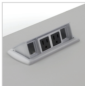
Select great options like the power/data miniport