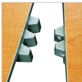
Instantly connect modular shapes with the ShuttleLatch