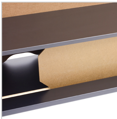
Oversized wire cavity with sliding doors in bottom provides easy access