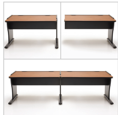
"Semi-fixed" starter/adder design is more flexible than built-in systems