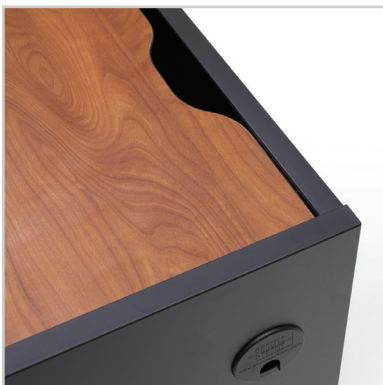
Contoured tops and grommeted sides neatly transfer wires