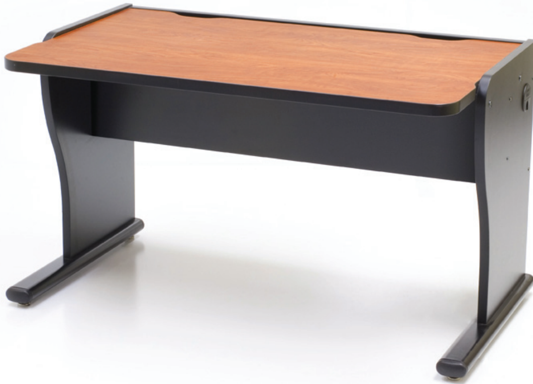
TANDEM 30x48 Straight Profile